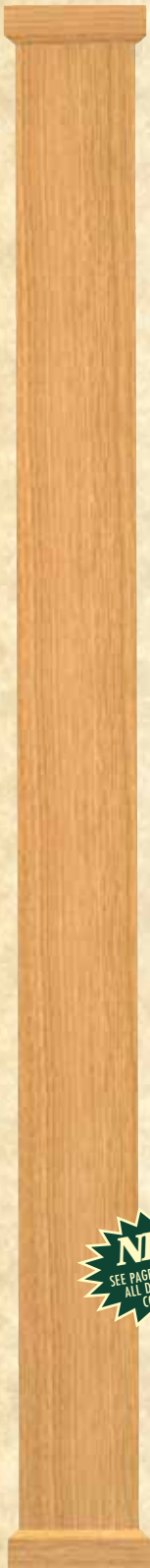
7½" x 8" Mission Column with Mission Cap and Base 35360-750-96

NEW SEE PAGES 70-71 FOR ALL DECORATIVE COLUMNS