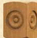
R1266 (on 3 1/2" Block)