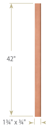
3 Length Baluster